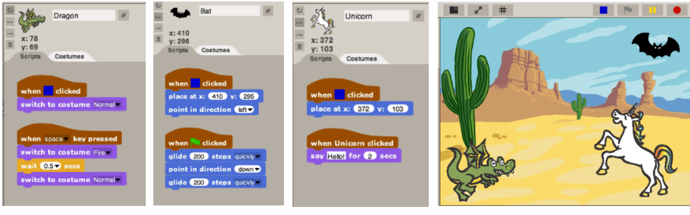
Figure 6. Scripts for