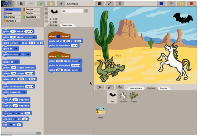
Figure 1. Layout of the first project

We used two sets of interview protocols each containing three projects: the same introductory project followed by two different projects. For this study, we only analyzed students' actions and discourse in the introductory activity, which was identical for all students. In this activity, the interviewer asked students to predict what the program would do if they ran it. Students explored the program while the interviewer asked follow-up probes to further clarify and expand upon what students were saying.